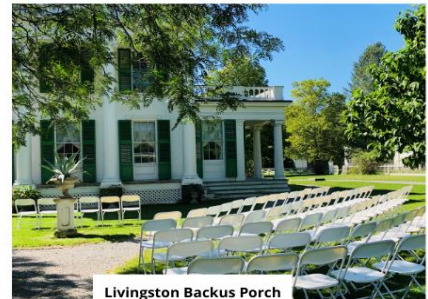
Livingston Backus Porch