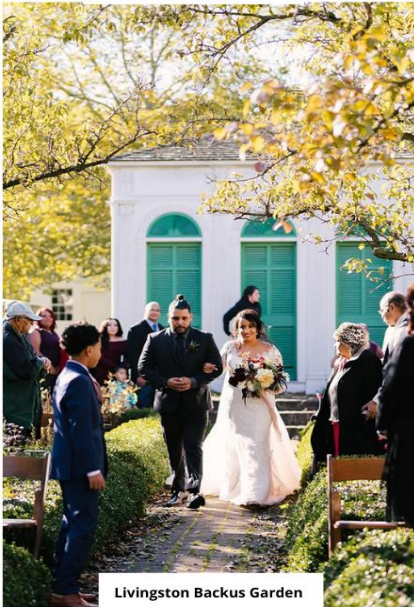
Livingston Backus Garden