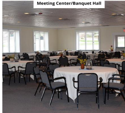
Meeting Center/Banquet Hall