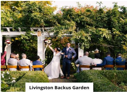
Livingston Backus Garden