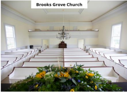
Brooks Grove Church