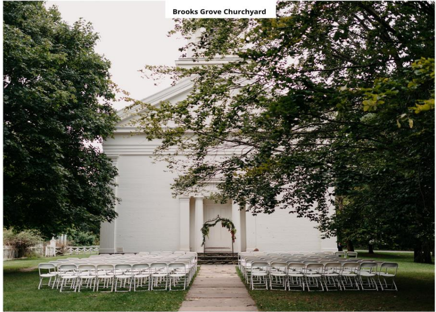
Brooks Grove Churchyard